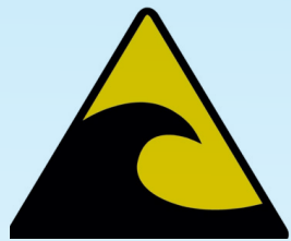
Tsunami hazard zone

Local authorities along the Mediterranean Sea shores prepared plans for the escape of population from the shore in an event of a tsunami