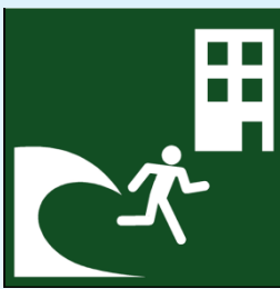
Escape route to a building with at least 4 floors