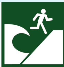
Escape route to an assembly zone